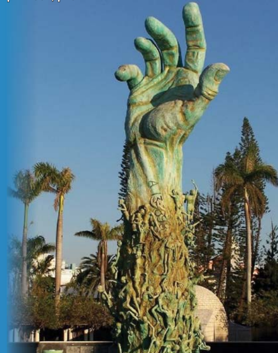
Holocaust memorial in Miami Beach, symbol for America's obsession with the Holocaust cult

Rabbi Kahane, the Jewish extremist, is less dangerous than a man like Elie Wiesel, who says anything that comes to mind. [...] You just have to read parts of Night to know that certain of his descriptions are not exact and that he is essentially a Shoah merchant [... Wiesel] has done harm, enormous harm, to historical truth. —Pierre Vidal-Naquet, Interview, Zéro (Paris), April 1987, p. 57